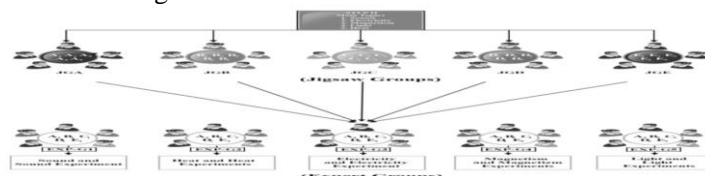
Figure 1. The work order formed for Jigsaw method adopted from Ataman Karacop (2017)

However, the major distinctions between the present study and the aforementioned ones was the embedded of the multimedia jigsaw, which was Computer Assisted instruction (CAI) or Computer Based Instruction model. Secondly, the present study felt that continuity of success is indispensable and that was why teachers of Mathematics needed to be taught for onward replication to the students, who different researches have made a focal point in the past. The training of a woman symbolizes a trained nation. Hence, its adoption promote a strategy that enhances academic achievement, attitude and other salient characteristics towards learning mathematics. Furthermore, jigsaw learning as an embedded mastery learning could be used in almost every subject, but it is more suitable in mathematics instruction since it helps students to develop a solid foundation of mathematical understanding in order to solve mathematical problems which involve a higher-level thinking and reasoning.